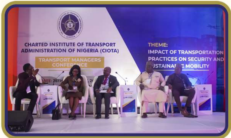
1st Panel Discussion of the day

A panel discussion featuring representatives from ALGON, CIOTA, Nation Insurer Association, and the Joint Tax Board further enriched the knowledge-sharing experience.