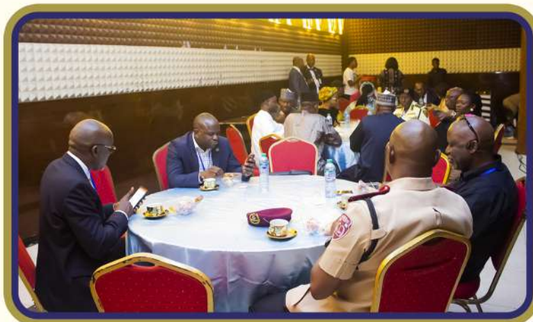
Guests and Resource Persons having a Tea Break