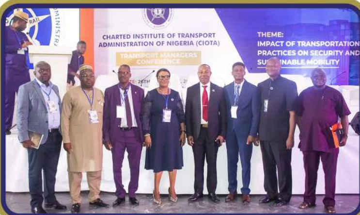
Panelists with the CIOTA President