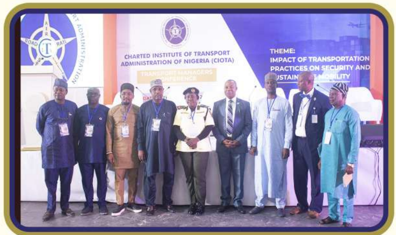
Panelists with the CIOTA President