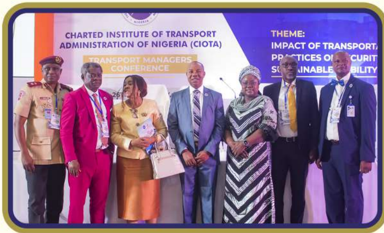
Panelists and Presenters with the CIOTA President