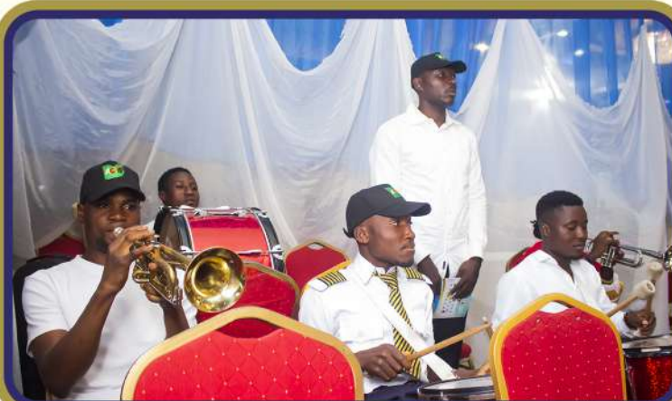
Temple Group Limited Band Serenading at the Event